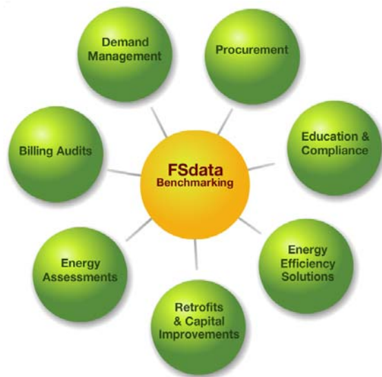
FIGURE 2 – Energy accounting database and analysis acts as the hub from which the Energy Master Plan deploys the appropriate tools to assist properties within the portfolio.

Beyond energy accounting and the related Energy Report Cards, and developing innovative approaches to finance major capital retrofits, the EMP employs a variety other tools and programs that can be integrated in each customized energy management plan for buildings seeking to reduce their energy efficiency. As illustrated in Figure 2 we use the database to identify and drive specific energy efficiency opportunities in buildings.